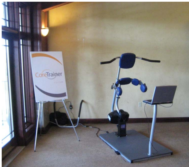
The Core Trainer was well located in the clubhouse of Thanksgiving Point, a Johnny Miller signature course.