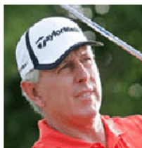
Some of the other well known golfers at the event